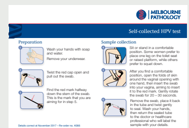
Self-collected HPV test Patient instructions (Packs of 10) (Code - K056)