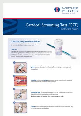
Cervical Screening Test (CST) - Collection Guide (Code - K054)