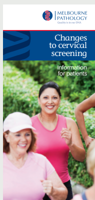
Changes to cervical screening - Information for patients DL (Code - K053)

Request a visit from your Business Development Manager to discuss the Cervical Screening Program